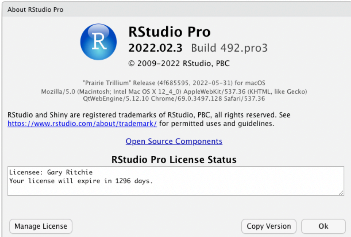
Figure 2: RStudio Pro About Dialog